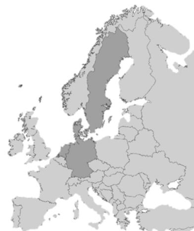
Fig. 1. CINDERELLA project countries

The study focused on incentives widely available for agriculturally used land, mainly agri-environment-climate schemes and other actions supported within the 2 nd Pillar of the CAP, which are co-funded by the European Agricultural Fund for Rural Development (EAFRD). Rural development programmes (RDPs) determine the national implementation of the aims of the 2 nd Pillar of the CAP. To account for differences among countries or regions, the 28 EU Member States elaborated 118 different RDPs for the current funding period (2014-2020) 1 . Next to the large number, language barriers limit accessibility, since RDPs are available only in the corresponding national language. After research on the RDPs of the CINDERELLA project countries Denmark, Germany, The Netherlands and Sweden (Fig. 1), examples of peatland related incentives from other European countries were included for supplementation.