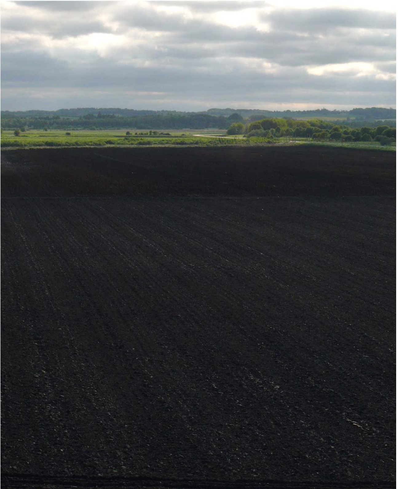
Field prepared for potato cultivation on peat soil, causing large amounts of GHG emissions. Funding the conversion of arable land into grassland, however, has little climate mitigation effect, since schemes usually lack requirements to raise the water level.