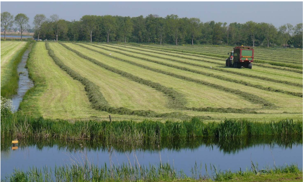
Peatland meadows intensively managed and drained to produce high-quality staple feed for dairy cows and ensure sufficient bearing capacity for heavy machinery.

The conducted survey aimed at disclosing additional examples of economic incentives for wet peatlands or wetlands in Europe as well as information on whom to contact for detailed experiences. Unfortunately, the return was disappointingly limited (n=9). However, answers from e.g. Canada and Southeast Asia (Indonesia and Laos) indicated that economic incentives for improving the provision of peatland ecosystem services are a hot topic all over the world and there is a need for further exchange. Not only the availability of information is limited, but indeed also few good practise examples are in place.