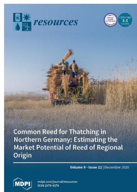
6 Cover of "Resources"

Out of 141 contacted companies, 47 participated in the survey. The majority of respondents (59%) used Reed for rethatching roofs completely, 24% for newly constructed roofs, and 17% for roof repairs. The total market volume of Reed for thatching was estimated for 2018 with 3 \pm 0,8 million bundles of Reed with a monetary value at sales prices of \text{€}11.6 \pm 2.8 million. Reed from Germany held a low share of 17% of the