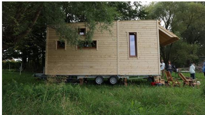
7 Paludiculture Tiny house

The Greifswald Mire Centre (GMC) is one of ten winners in the nationwide university competition “Show your research” in the Science Year of the Bioeconomy (2021) . It awarded lively communication ideas that make research accessible to the general public and at the same time show their social significance. The peatland researchers won the competition with the idea of taking the Paludi Tiny house on a roadshow. In this mobile “house on wheels”, Reeds, Cattails and alder are used as energy-efficient building materials in insulation, panels, roofing or sound proofing. The “little house” shows a big idea: Wet peatlands are extremely important as carbon stores for climate protection. In order to make this form of bioeconomy better known among municipalities, land owners and users, administrators and consumers, the roadshow will take its route through peatland areas in northern Germany in autumn 2021. It will also be accompanied interactively on social media.