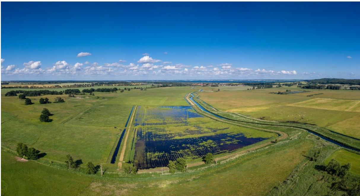
5 Bird's perspective on PRIMA pilot site

Since June 2019, the project Paludi-PRIMA puts paludiculture with rReeds and CCattails into practice. For this purpose, a field-scale cultivation trial with 50,000 Cattail seedlings ( Typha angustifolia and T. latifolia ) was established on a fen grassland in North Eastern Germany. Stand establishment and growth were monitored during the first growing season. In addition, two mesocosm experiments were conducted at the Arboretum of the University of Greifswald, where plant growth in response to different environmental factors was investigated. First findings from these two areas of work as well as on the genetics of common Reed ( Phragmites australis ) and the market potential of Reed for roofing will be presented here.