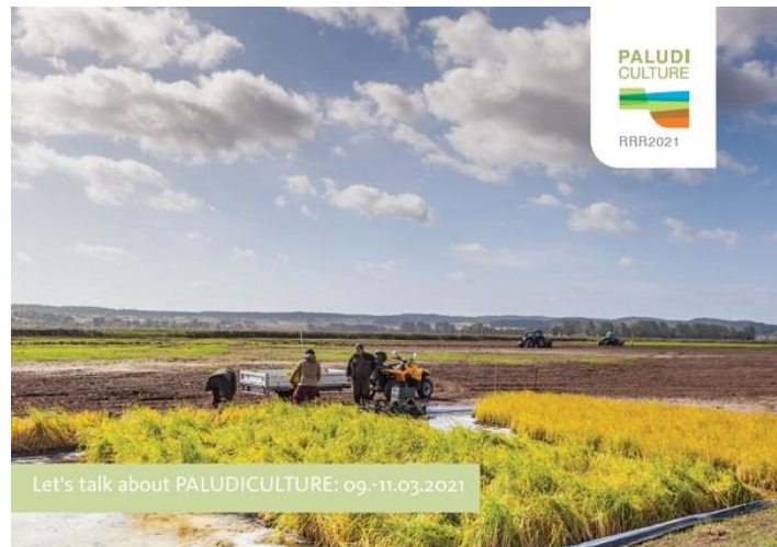
1 RRR2021-Invitation

You can expect passionate keynote speakers in plenary sessions at the beginning of conference day 1 and day 2. Altogether more than 100 scientific oral and poster presentations are divided over 21 parallel sessions. The session on Finance options for livelihoods from wet peatlands is co-organised with FAO, UNEP, IUCN and WWF . Excursions usually represent one of the most enjoyable and inspiring part of the programme when traveling to conferences. Since this part cannot take place, eight inspiring virtual paludiculture excursions will be presented. The workshops, literature evening, and an art session are some other highlights in the programme. Several booths in the virtual exhibition hall expose wetland-related products, techniques, and services. The virtual platform provides the best networking opportunities with discussion forums, open spaces, and face to face conversations to get in contact with scientist, practitioners, pioneers, and other experts from all over the world. The RRR2021 conference is organised by the partners in the Greifswald Mire Centre and funded by the German Research Foundation. For questions, please contact info@rrr2021.com .